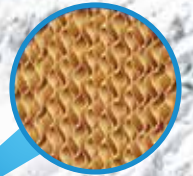
3 Sided High Efficiency Odour Free Honeycomb Pads