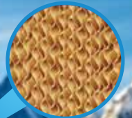
3 Sided High Efficiency Odour Free Honeycomb Pads